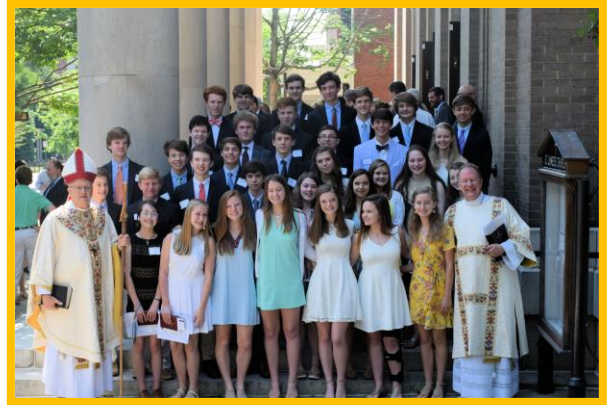
Confirmation Sunday 2019

Mentors: Each confirmand will select a non-parent adult mentor (sometimes called a sponsor) who is willing to support them throughout the confirmation process. Students will learn more about the role of a confirmation mentor during Session one this fall, so please wait until then to ask someone to be your mentor. Youth will be expected to meet with their mentor 3-5 times in-person or virtually over the course of the year. These meetings can happen anytime between now and confirmation Sunday, at a time and location that's convenient for you and your mentor. During these meetings, we encourage students to tell their mentor about their confirmation experience, ask their mentor about their faith life/spiritual journey, and discuss any questions students may have. We also encourage students and mentors to go to church together if possible. A great opportunity to do this is during Holy Week. These “meetings” can also be relaxed and fun – perhaps an outing to a farmers market or ice cream. Mentors are invited and encouraged to attend the Confirmation Rehearsal & Banquet and Confirmation Sunday in the spring to “present” the confirmands to the bishop. If that’s not feasible, the confirmation leaders can stand in as your sponsor that day.