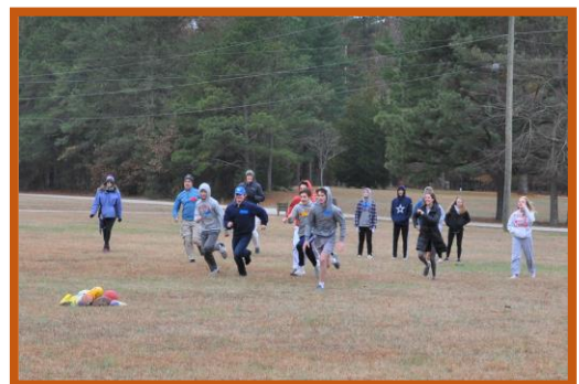
Confirmation Camp 2018

Partnering with Parents: Parents are the #1 influence on their child’s faith formation process. This is why we stress the importance of attending worship services regularly as a family. Don’t worry, the church doesn’t expect you to navigate this road alone. The St. James’s clergy, youth staff, and confirmation leaders are here to support you as parents, just as much as your child in the confirmation program. Please let us know how we can help you along this journey.