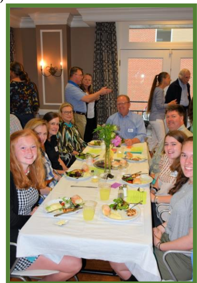
Confirmation Banquet 2019