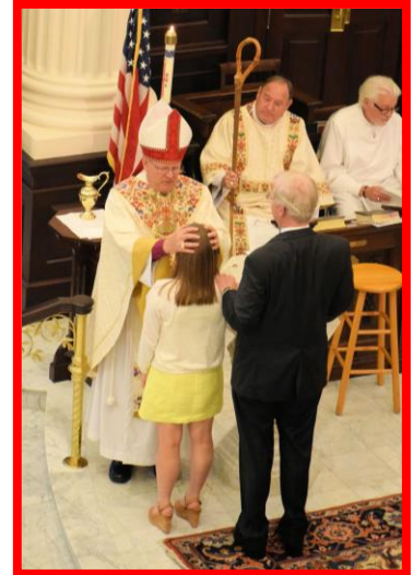
Confirmation Sunday 2019

The Episcopal Church's theology of confirmation has continued to evolve along with its understanding of baptism. Confirmation is no longer seen as the completion of Christian initiation/membership, nor is confirmation your meal ticket or a prerequisite for receiving Holy Eucharist (or communion). Baptism is now understood as full initiation by water and the Holy Spirit into Christ's body the Church (BCP, p. 298). Accordingly, confirmation has been increasingly understood in terms of a mature, public reaffirmation of the Christian faith and the baptismal promises. Confirmation is not graduation from faith formation, but rather marks the beginning of mature participation in the mission and ministries of the church.