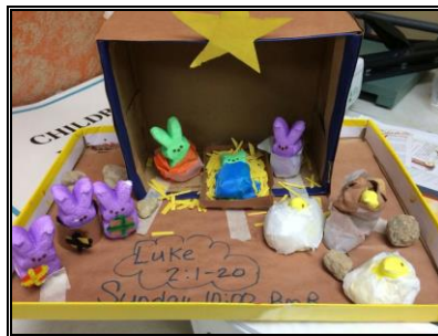
Birth of Jesus