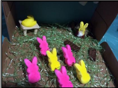
Worshipping the Golden Calf

Yes, it's a contest too! There will be on-line voting and, yes, there will be prizes!