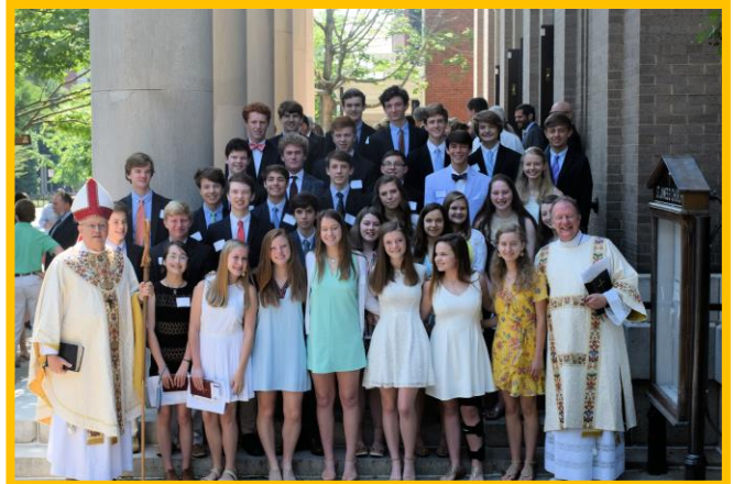
Confirmation Sunday 2019