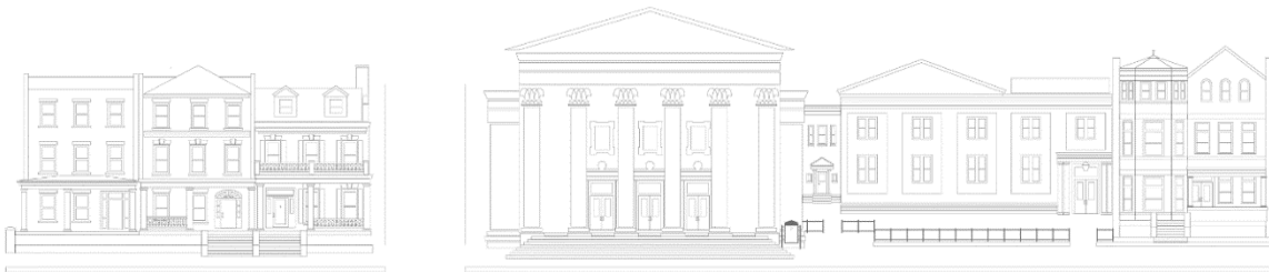
L to R – Michaux House, Birch St., Sanctuary, Memorial Garden, Gibson Hall, Playground, Parish House