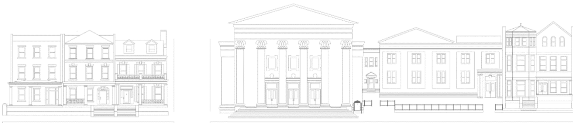
L to R – Michaux House, Birch St., Sanctuary, Memorial Garden, Gibson Hall, Playground, Parish House