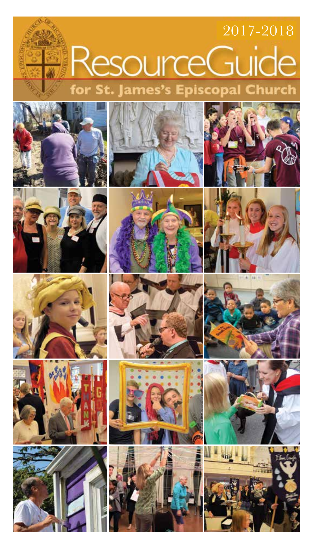
Be ye Doers of the Word and not Hearers Only