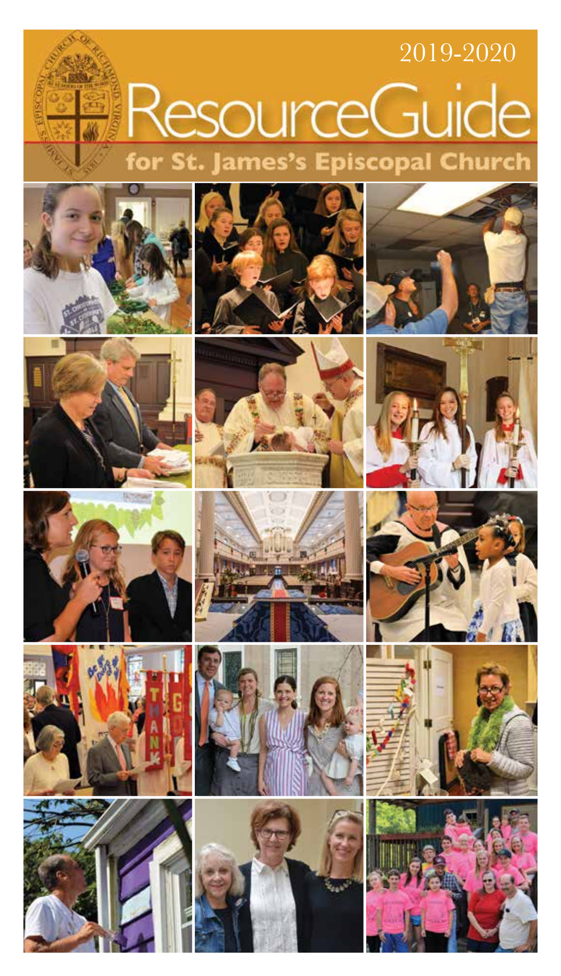
Be ye Doers of the Word and not Hearers Only